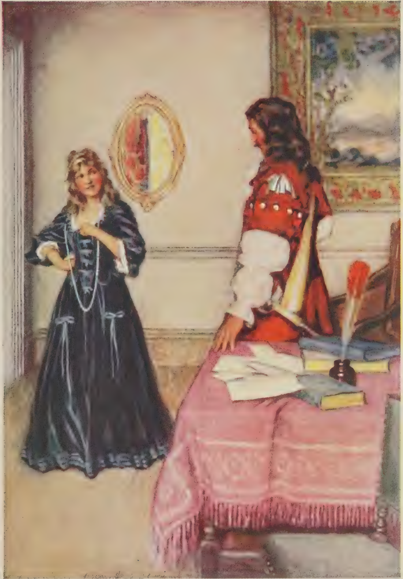
'I HAVE SAID THAT I AM SORRY'